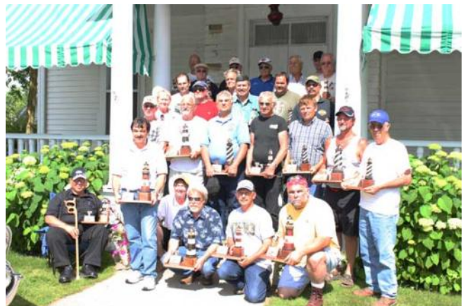
Here's all the trophy winners for this year's show.