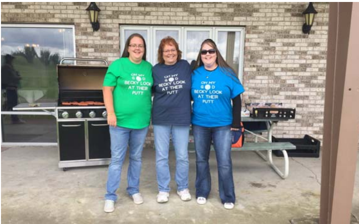
The Golf Outing was a success thanks to the effort of many volunteers. The attached pictures are just a few of the people who contributed.